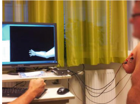
Fig. 13.1 Virtual hand controlled by an amputee via pattern recognition of myoelectric signals

Input devices are important for each VR system to provide the user with intuitive ways to control events within virtual environments. Examples of commercial devices include standard PC peripherals such as: keyboard, mouse and joystick; posture platforms; marker-based motion capturing and tracking systems (e.g. OptiTrack), infrared light (e.g. Microsoft Kinect, ARTTRACK3), instrumented gloves (e.g. AcceleGlove and CyberGlove) and inertia trackers in handheld devices (e.g. accelerometer/gyroscopes in smart phones or the Nintendo Wii); and more recently, brain-computer interfaces (BCIs) that detect electroencephalography patterns of the user (e.g. Emotiv Epoc). On the research side, the prediction of motion intent based on patterns of myoelectric activity is also used as input for VR systems (Ortiz-Catalan et al. 2013). Figure 13.1 shows a transhumeral amputee controlling a virtual hand through pattern recognition of the myoelectric activity recorded on the surface of the subject's stump (Fig. 13.1).